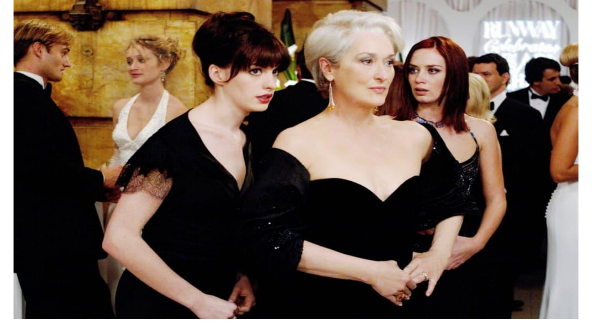
#4 PREPARE A STRATEGY ;)